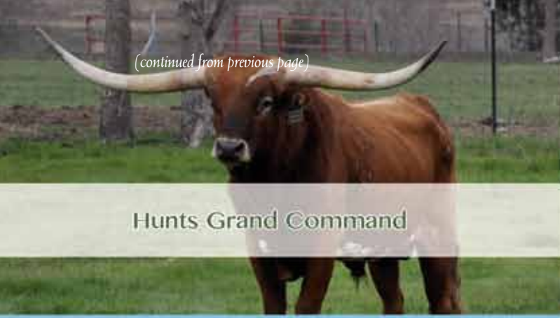
Hunts Grand Command