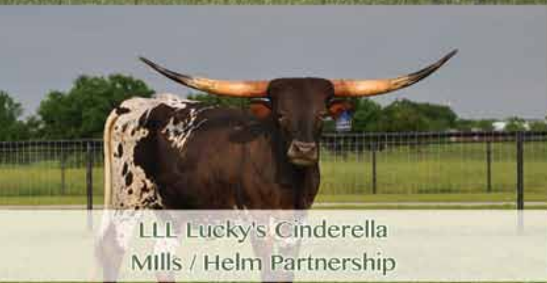
LLL Lucky's Cinderella Mills / Helm Partnership

Our entire family enjoys auctions and we attend as many as we can together. Some of our greatest impact foundation females have been purchased at major auctions like the premier Texas Longhorn Legacy Sale. Wiregrass Laura who is now over 80" Tip to Tip, ASOCL Burning Desire, nearing 80" Tip to Tip and SL Selenas Ace, nearing 74" Tip to Tip, are just a few of the great females that we have bought. But as much fun as the auctions were, we quickly became serious about improving our herd through our own breeding.