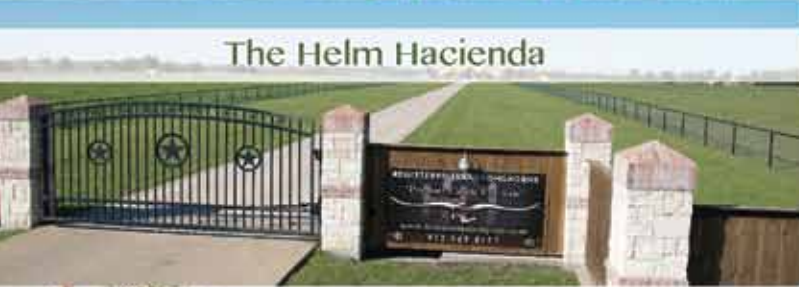
The Helm Hacienda